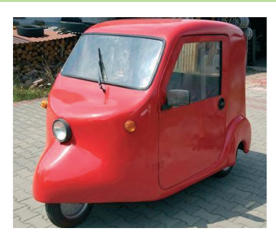
Fig. 6. Desamet 755 [8]

Another example of technical thought was the Motorydwan Norka – Dezamet (Figure 6), powered by the Romet Chart engine with a capacity of 50 cc, with automatic transmission. The vehicle was a two-person vehicle, the total weight was 335 kg, the load capacity was 190 kg, with an electric starter, the prototype was produced in 1996. The idea was based on the German model of Simson DUO. Simson Duo, on the other hand, is the colloquial name of the simple-in-design, two-seater DUO three-wheeler, produced in the years 1972–1991 in the German Democratic Republic, intended for people with mobility disabilities. From 1972 it was produced in FAB Brandis as DUO 4, and from 1973 as DUO 4/1.