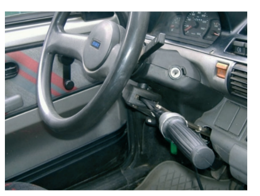
Fig. 13. RGH I adaptive device [34]

Manual control lever RGH I – produced by CEBRON Warszawa. The levers operated the accelerator by turning the handle, with Bowden cable visible in the photo (Figure 13), while braking was performed by pushing the handle away. The device did not have a brake lock. This type of solution was the oldest model, currently not used [20, 27]. The Cebron company has produced versions II, III, IV and V Pantera. The first and only manufacturer that met the needs of the disabled community on a Polish market. The simple structure did not constitute an economic barrier in the acquisition costs.