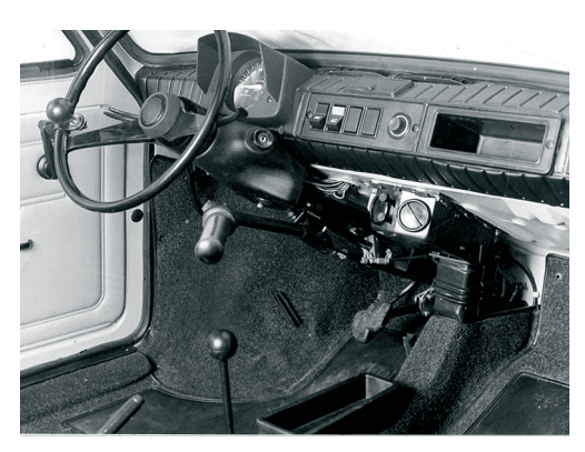
Fig. 12. The adaptation device used in the Fiat 126, RGH I car [35]

Minister of Labour and Social Policy, established over 50 years ago for research and implementation in the field of social and professional rehabilitation (1959).