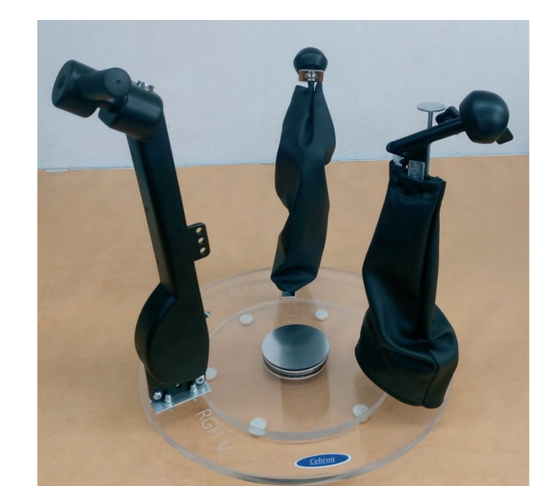
Fig. 14. RGH - II, IV, V

Currently, Cebron (Figure 14) produces 3 versions of a mechanical device. The multi-function lever allows you to declutch when pressed, locking in any position and allowing you to change gear. Acceleration is obtained by turning the knob located at its base, while in order to brake, push the lever towards the dashboard of the car.