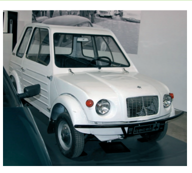
Fig. 5. Gacek [12, 13]

The group of designers of this vehicle received in 1970 the award of the Minister of Culture and Art for achievements, and in 1971 the NOT award for outstanding achievements in the field of technology. Plans for the development of Gacek's design were prepared [6, 44]. After many years, the only example went to the Faculty of Mechanical Engineering of the Cracow University of Technology, where, under the supervision of professors, a group of pupils from vocational schools in Krakow dealt with its reconstruction for 2 years. The only one in the world Gacek is currently operational, and is located at the above-mentioned Faculty [13, 44, 45].